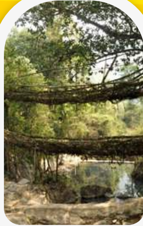
DOUBLE DECKER BRIDGE