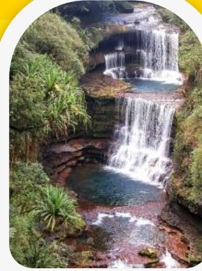
WEI SAWDONG FALL