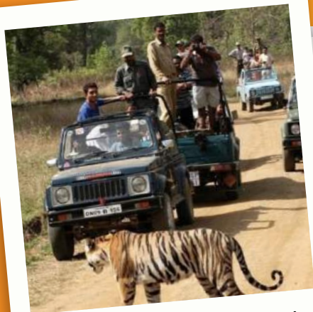
Jungle Jeep Safari